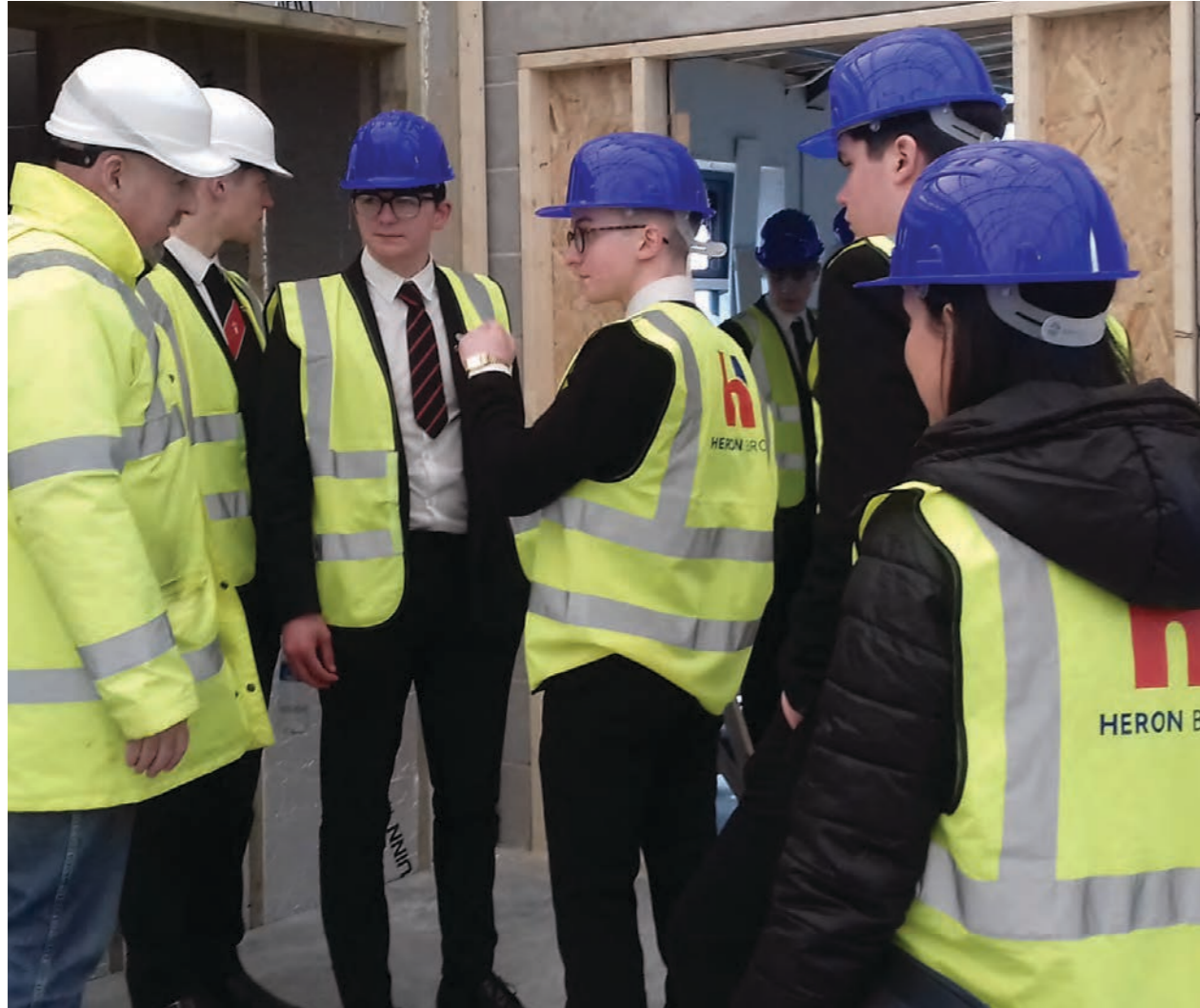
Careers trip to the new Ards and North Down Borough Council Leisure Centre site