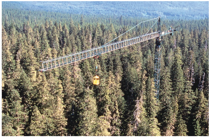
Figure 1. The forest canopy of the Pacific Northwest and the Wind River Canopy Crane Research Facility. The WRCCRF is one of several research sites specialized for studying the forest canopy. A construction crane lets researchers study the canopy from multiple viewpoints. Several researchers working with the Canopy Database Project use this crane site.

Our initial objective was to integrate database use very early in the research cycle—ideally starting with a study's initial design. Specifically,