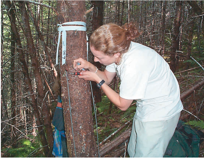
Figure 4. Part of a field installation for a study of environmental controls on ecosystem-scale physiological processes. A student is installing a sensor to continuously monitor the flow of water through the sapwood of a Douglas fir tree.

Another reason why data documentation is a critical aspect for Bond’s lab is that to answer a question in tree physiology, her researchers must piece together several types of information from different sources. Many data sources are used in a typical study, and lots of studies ongoing in the laboratory at any given time, so data sources for concurrent studies typically overlap. A typical small project might use the following information: