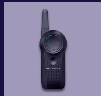
PMUF1983 CURVE RADIO