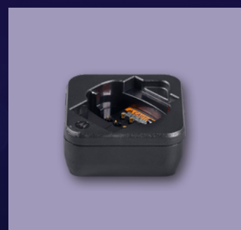
PMPN4587 SINGLE-UNIT CHARGER