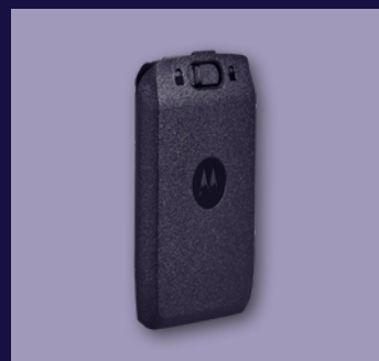
HKNN4013ASP01 BT90 STANDARD CAPACITY BATTERY