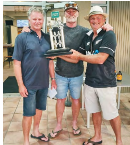
KPA Twilight Bowls Winners