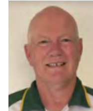
Chris Smith Events