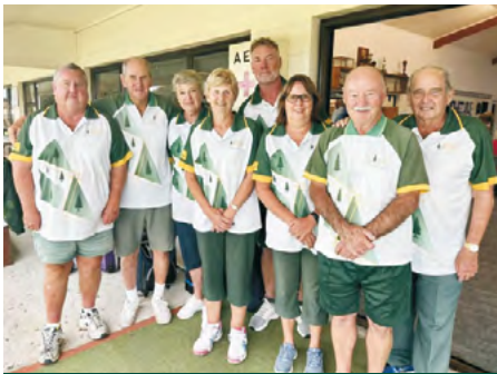
Inter-Club Winners 2022/23