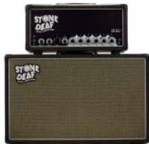
SD50: 50 Watt Analogue valve amplifier with digital control and 128 presets