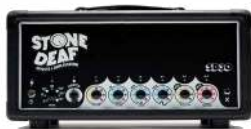
SD30: 30 Watt Analogue valve amplifier with digital control and 128 presets