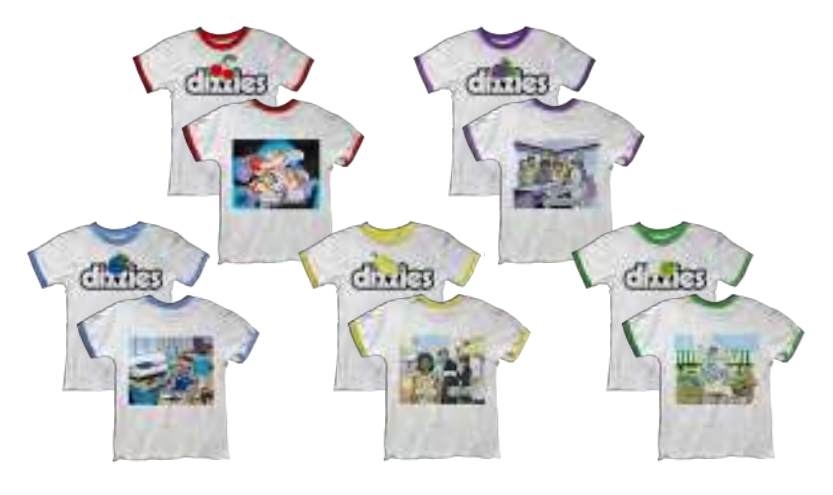
RINGER T-SHIRTS $25