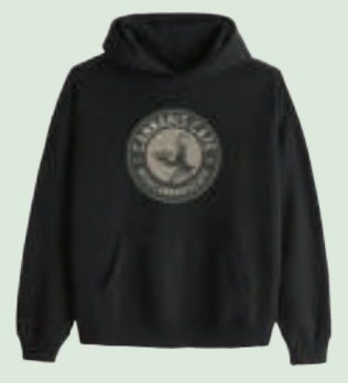
CAFE HOODIE | $50 AVAILABLE IN: S M L XL