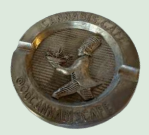
CAFE ASHTRAY | $30