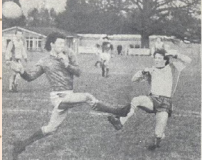
Send it in — A Harpenden player, light shirt, to another cross in against Wingate on Saturday.