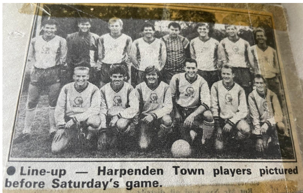
● Line-up — Harpenden Town players pictured before Saturday's game.

Wingate took the lead in the first half, then