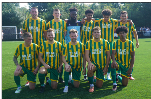
Above: Harpenden Town: September 9, 2023