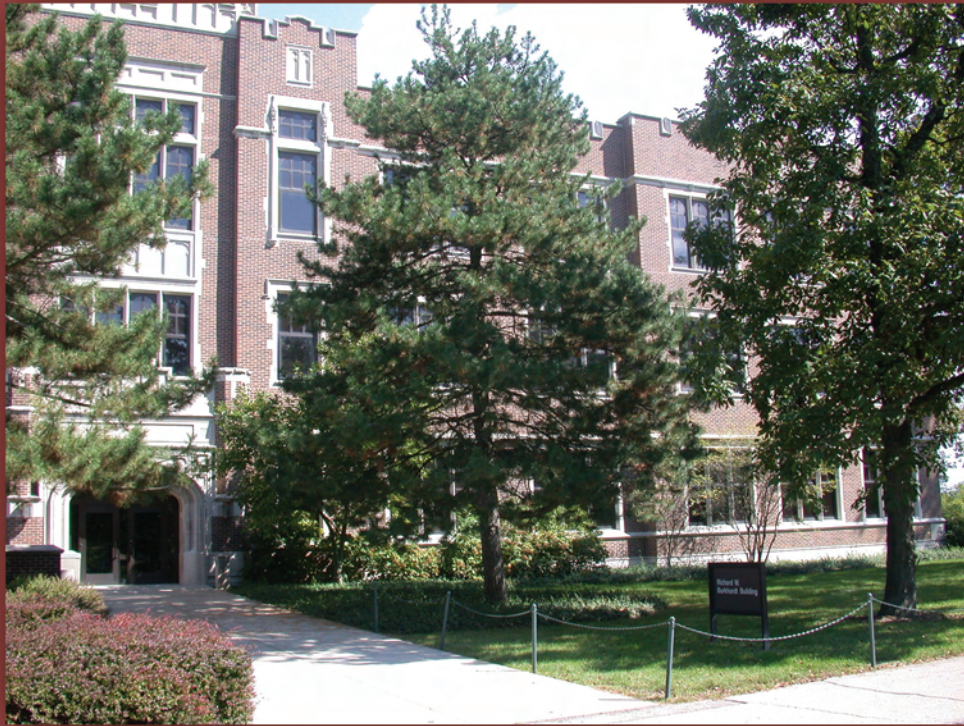
National Office of Lambda Alpha is located in the Burkhardt Building shown in this photograph, on the Ball State University campus.