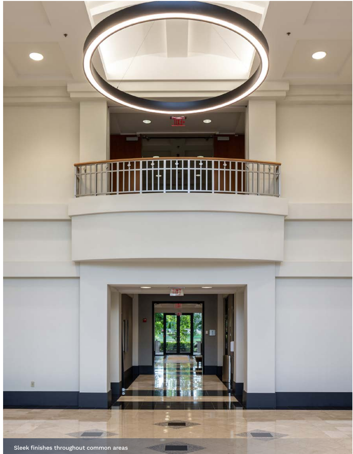
Sleek finishes throughout common areas