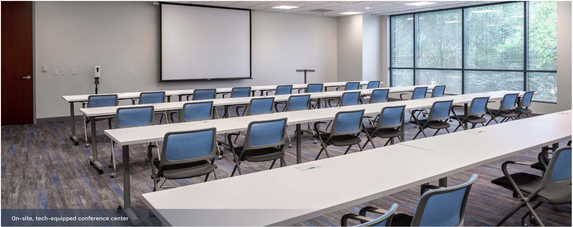
On-site, tech-equipped conference center