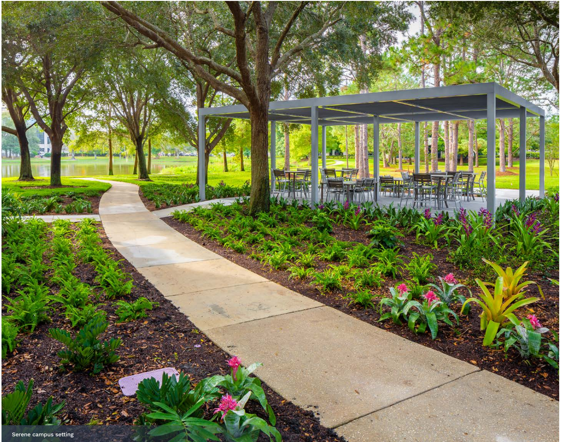
Serene campus setting