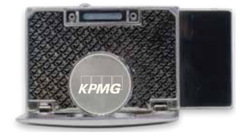
BALL MARKER Upgrade: $6.00 (A)