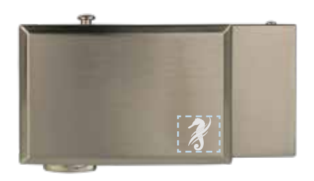
Corner buckle customization