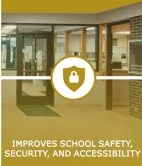
IMPROVES SCHOOL SAFETY, SECURITY, AND ACCESSIBILITY