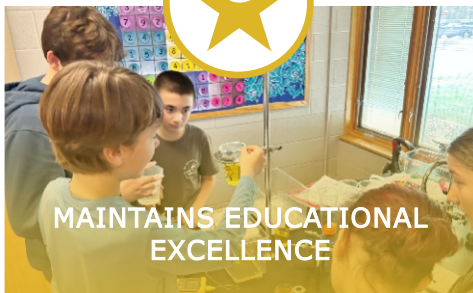
MAINTAINS EDUCATIONAL EXCELLENCE