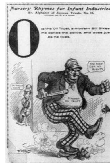
“O” is the Oil Trust, a modern Bill Sikes; he defies the police, and does just as he likes.’ A 1901 cartoon by Frederick Opper.