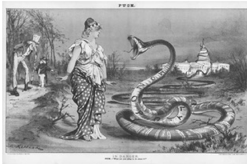
In 1881 America is menaced by the serpent of monopoly. Puck magazine asks Uncle Sam what he’s going to do about it.

profitability, thus share prices, and thus their personal wealth) which drive the decision-making of these corporate leaders.