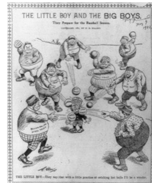
Frederick Opper's 1901 cartoon depicts the trusts as they take aim at the common people.