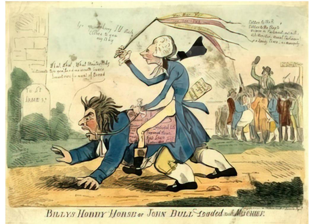
Britain's tradition of anti-monopoly agitation is weaker than the United States'. But as this 1795 cartoon depicting John Bull being ridden by Prime Minister William Pitt shows, it does exist.

All markets suffer concentration or monopolisation, to a lesser or greater degree. In some areas, called natural