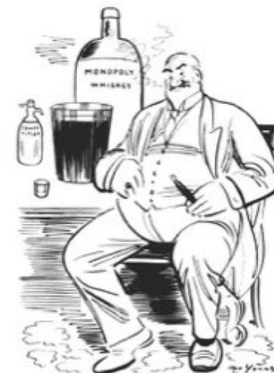
“I Like a Little Competition” —J. P. Morgan

It’s also perhaps not a coincidence that the managerial power of these corporate leaders (and the economic power and