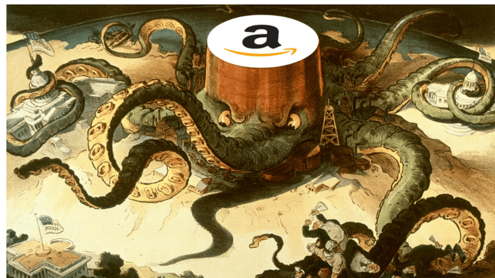
Always a new monster: Amazon replaces Standard Oil as top predator. Udo Kepler's classic 1904 cartoon, as updated in 2017 by Michael Wuwerker. (CC BY-SA 4.0)