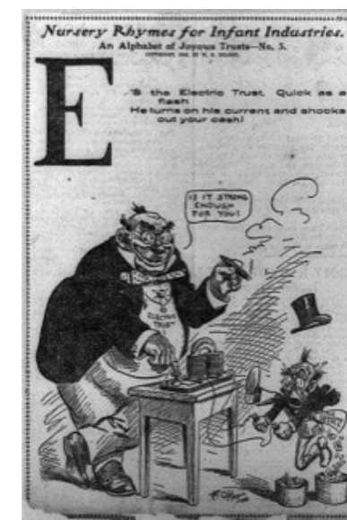
In this 1901 Frederick Opper cartoon the Electric Trust uses an electrical device, monopoly, to shock the common people.