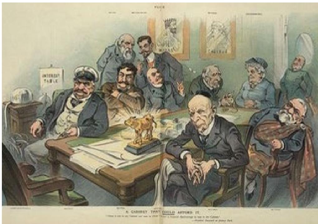
John Pughe's 1905 cartoon depicts a fantasy Cabinet for Theodore Roosevelt that includes notorious monopolists Pierpont Morgan, John Rockefeller and Andrew Carnegie.

combined regular corporate tax and excess profits tax could not be higher than 80%), and this tax was retained until the Korean War in the 1950s.