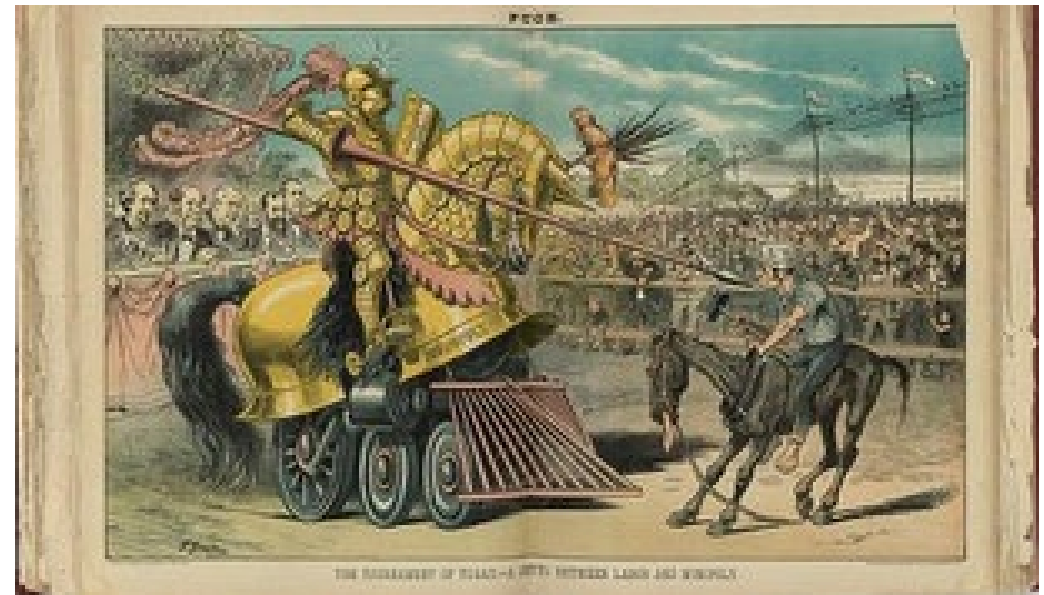
An 1883 cartoon by Friedrich Graetz depicting 'The tournament of today: a set to between labor and monopoly'.

Corporate lobbying soon eliminated the publicity of corporate tax returns, but the corporate tax itself proved more resilient. During World War I, income tax rates were raised dramatically to finance the war effort, and this included the corporate tax rate, which was raised to 12%. In addition, from 1917 onward a series of excess profits and war profits taxes were imposed on corporations that profited from the war. The war profits tax was levied on corporate profits above a three-year pre-war average,