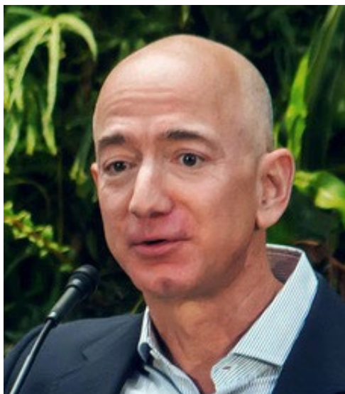
Jeff Bezos, the head of Amazon, is one of the billionaire 'blockholders' whose fortune derives from control of a company with massive market power.

T oday large incumbent firms dominate industries across the United States – from meat to medicines, from finance to tech, from retail to telecoms. This historic turn away from a dynamic multi-player business sector to a stagnant private sector stunted under the shadow of a few mega-oligopolies has real consequences for people.