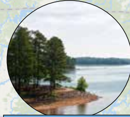
LAKE LANIER, GA

THE EAST COAST REGION OF NC, SC, AND GA HAS OVER 6,000 MILES OF SHORELINE. PLUS, THE REGION HAS 9,000 SQ MI. OF INLAND WATER