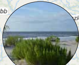
SAINT SIMONS ISLAND, GA

FREE COPIES ARE PROVIDED AT OVER 500 MARINE DISTRIBUTION LOCATIONS