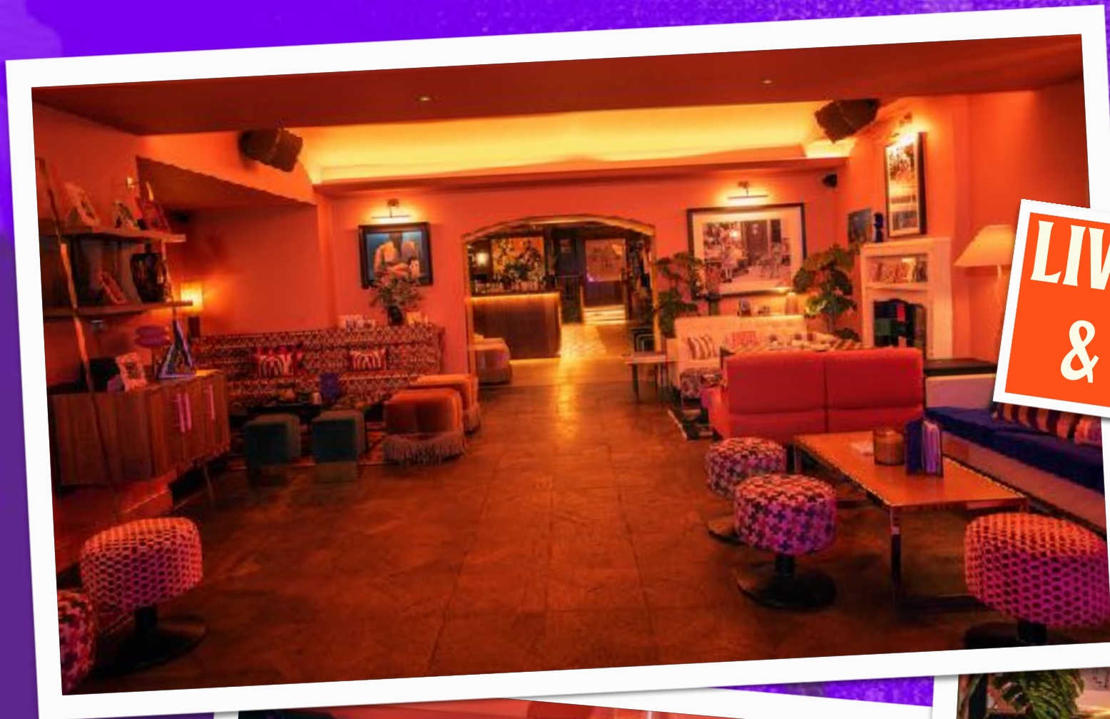
LIVING ROOM & KITCHEN