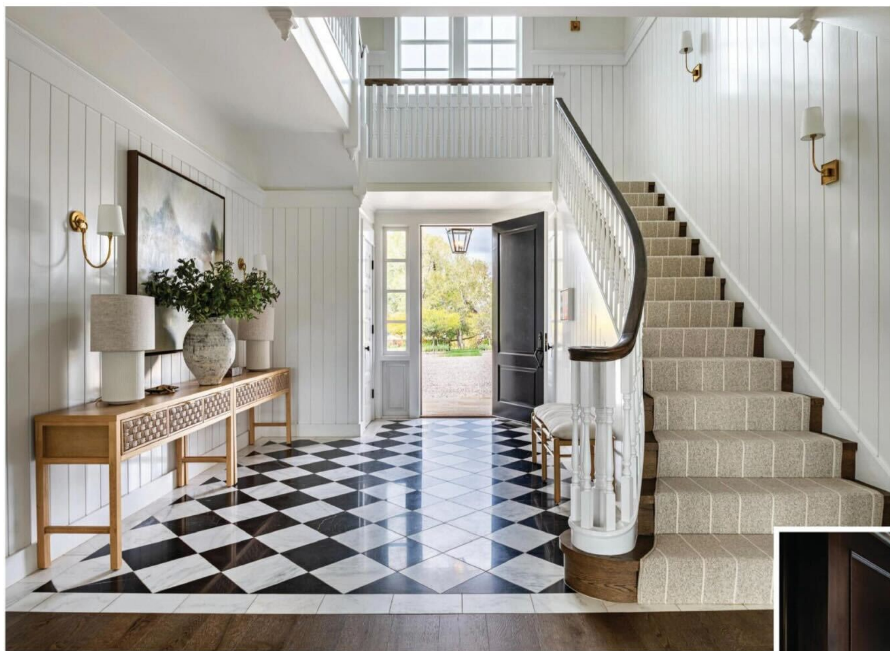
Foyer Original checkered marble flooring was preserved for the statement-making entry. Hearth room Practical while still picturesque, creamy bouclé upholstery blankets the hearth room, where artful snowboards depict ski season. Library Laid-back for enjoying a glass of whiskey, the library is collected and layered—including the leather sofa and an inventory of books. Previous pages In addition to the facade being repainted, stone cladding—some original and some new—gave the exterior a facelift that honors preexisting craftsmanship.