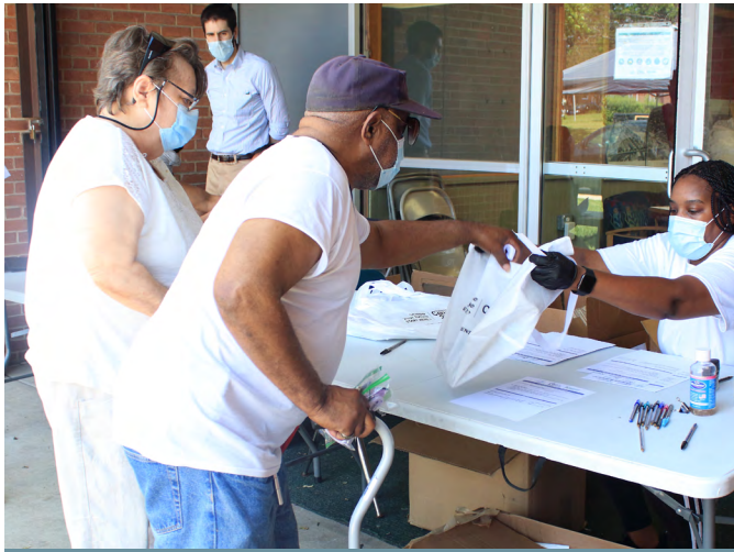
REACH RIVERSIDE (CASE STUDY, PAGE 16)