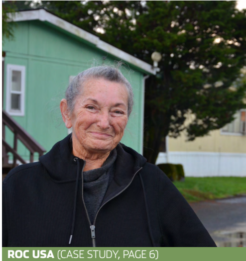
ROC USA (CASE STUDY, PAGE 6)