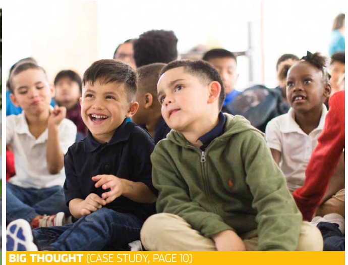
BIG THOUGHT (CASE STUDY, PAGE 10)

The times require that the players in the nonprofit capital markets make fundamental changes in their funding and financing practices.