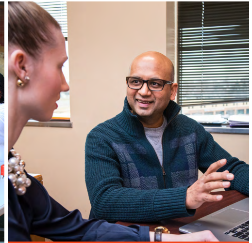
PREPARE + PROSPER (CASE STUDY, PAGE 21)

The Blueprint also includes a “Primer” in Appendix A that outlines a step-by-step process for funders to use in designing and implementing an enterprise capital approach. Appendix B offers a glossary of all the financial terms used in the Blueprint to ensure that this document is accessible and transparent to every reader, regardless of financial expertise.