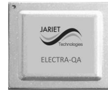
32.5mm x 27.5mm BGA Package

An fs/16 or fs/32 reference clock is distributed to each bank of two channels, and multiplied up by a per-channel PLL to the sample clock. The PLL can also be bypassed and an external fs/2 sample clock applied, to address phase noise sensitive applications.