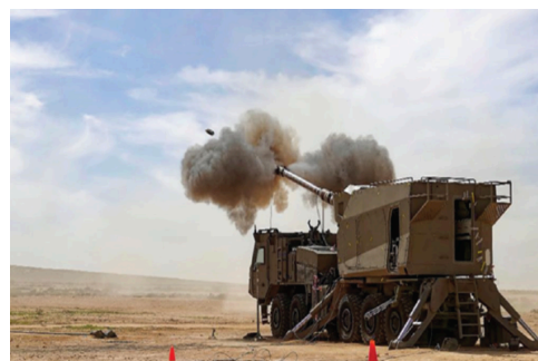
Figure 1: Sigma Next Generation Howitzer. (United States Field Artillery Association.)

It is not known whether Elbit Systems in Ladson has begun exporting to Israel.