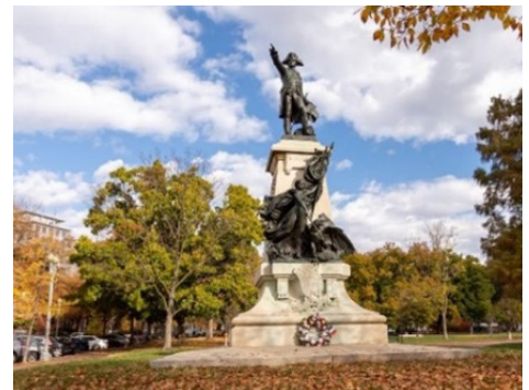
3 General Rochambeau Statue (France) – 1902