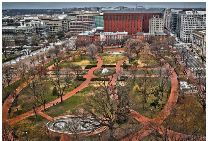
Today's Lafayette Park, in need of restoration.