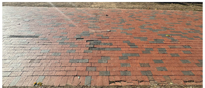
Landscape elements, including seating, turf and aging plantings need complete overhaul.