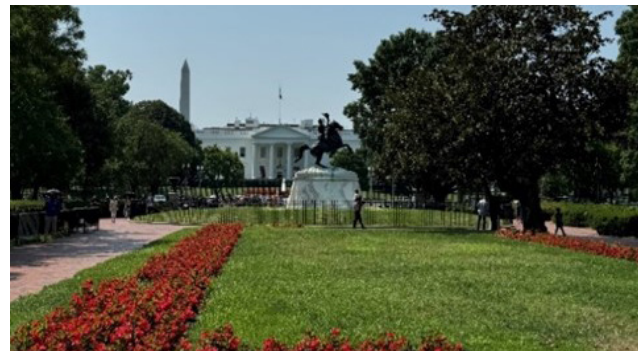
5 General Andrew Jackson Statue