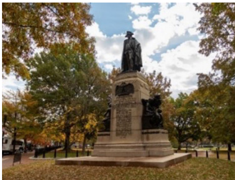
1 General Von Steuben Statue (Prussia) – 1910