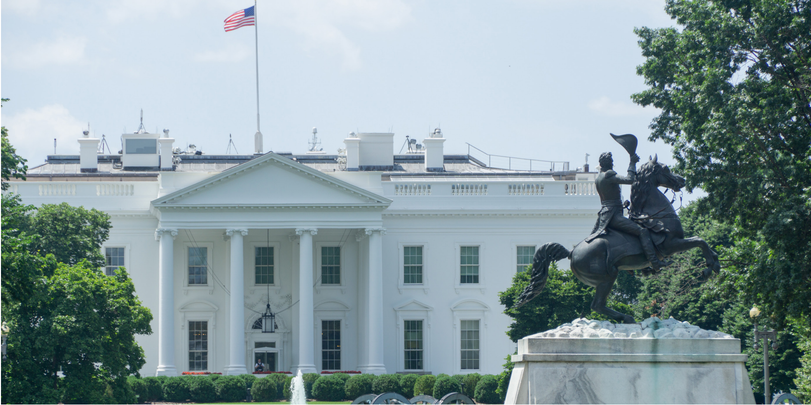
View of the north side of the White House from Lafayette Park.