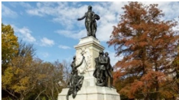
4 General Lafayette Statue (France) – 1891