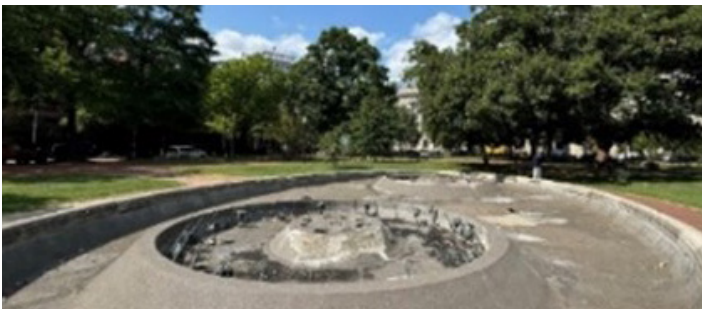
Signature fountains are out of order and have not flowed for many years