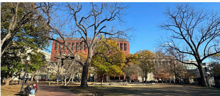
The tree canopy that serves as the architecture of the park is in need of care and restoration.