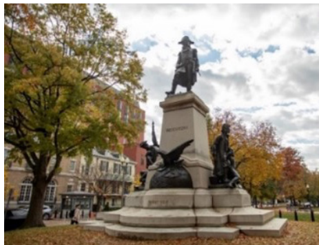
2 General Kosciuszko Statue (Poland) – 1910