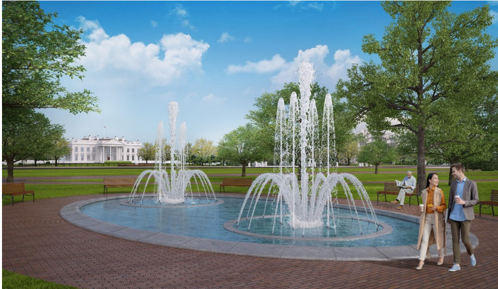
Rendering of restored Lafayette Park fountains

Inspired by the American Semiquincentennial, the Trust for the National Mall invites you to help create a verdant and vibrant public space in Lafayette Square, across from 1600 Pennsylvania Avenue, America's most famous address. Join us to honor American history and our nation's founding and to prepare Lafayette Park to greet the 50 million people anticipated to visit for this historic American milestone in 2026...and beyond.