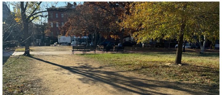
Significant wear due to deferred maintenance, lack of federal funds, and heavy foot traffic