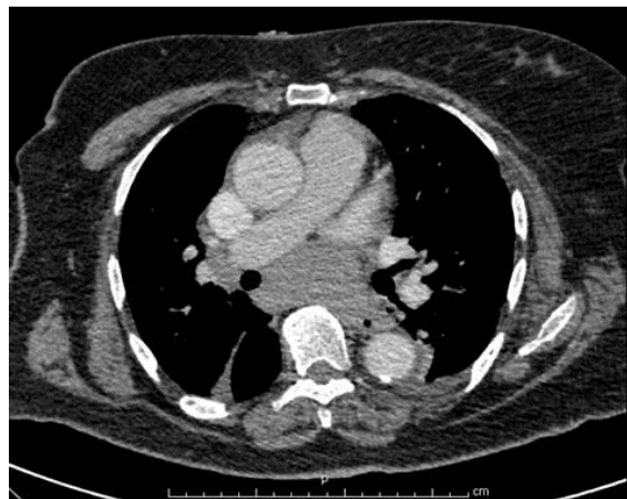
Figure 1. Subcarinal mass. Density ranged from 25-80 Hounsfield Units.

A 68-year-old African American woman with hypertension, diabetes mellitus type 2 and end-stage renal disease, on home hemodialysis, presented to the hospital with central stabbing chest pain, radiating to the back, accompanied by shortness of breath. An initial HRCT chest performed to rule out aortic dissection revealed a large subcarinal mass, measuring 2.3 cm x 6.5 cm x 3.8 cm (AP x transverse x height), that splayed the carina, exerting mass effect on the esophagus, raising suspicion of malignancy (Figure 1).