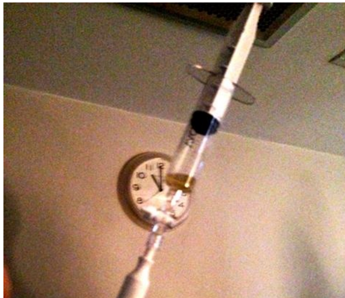
Figure 5. Serous aspirate from cystic cavity.

Both the lymph node and cystic space were sampled. Ten mL of serous fluid was aspirated from the cystic space, resulting in obliteration of the cavity, as visualized on the ultrasound (Figure 5).