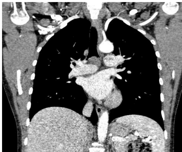
Figure 3. Chest CT showing subcarinal lymphadenopathy and mass. Density of mass 9-95 Hounsfield units.

A bronchoscopic exam with EBUS evaluation of lymphadenopathy was scheduled. On FOB, the patient was found to have an incidental endobronchial mass occluding the anterior segment of the right upper lobe. EBUS exam revealed an enlarged subcarinal lymph node (8 mm) with an adjacent cystic space containing homogenous hypoechoic material (Figure 4).