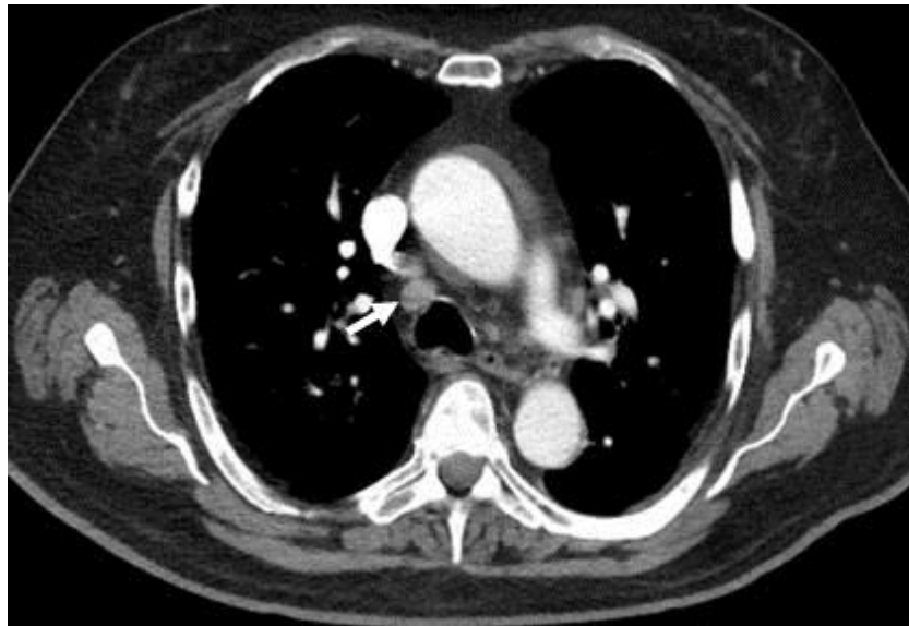
Figure 4. Thoracic CT in soft tissue windows showing lymph node at 4R (arrow).

The interstitial prominence is increased and seems more nodular. The small pleural effusions have decreased in size. There are no intraluminal filling defects or vessel cutoffs suggestive of pulmonary emboli. In addition, the soft tissue views showed prominent lymph nodes in the 4R position (Figure 4).