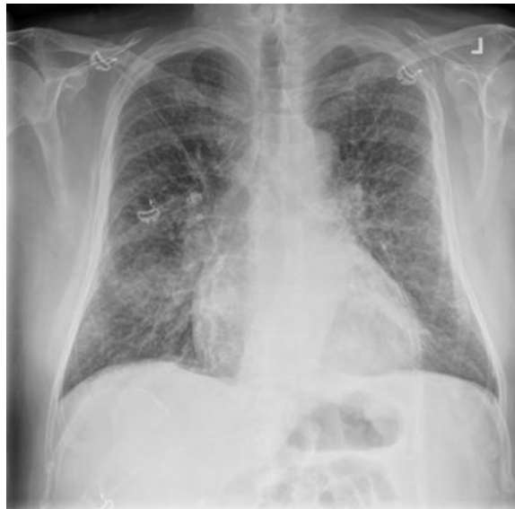
Figure 2. Chest x-ray from second admission.

A chest radiograph was again performed (Figure 2).