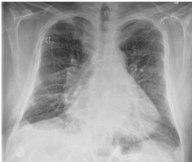
Figure 1. Admission chest x-ray.